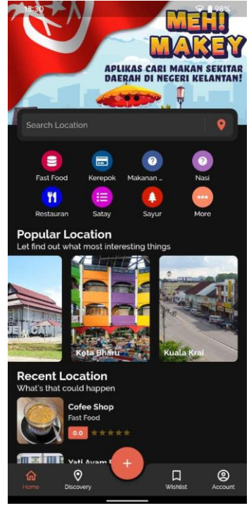
Figure 1: Main Menu

There are four primary buttons on the application's bottom side: home, discovery, wishlist, and account. The tourist can access this application using the home button. It simplifies the navigation process for travellers. While, the discovery button guides tourists to the appropriate cuisine kind. The discovery button's operation is illustrated in Figure 2. The wishlist feature then enables tourists to save their preferred cuisine and location for future reference. The account button enables users to have complete access to this application by logging in with their Google account.