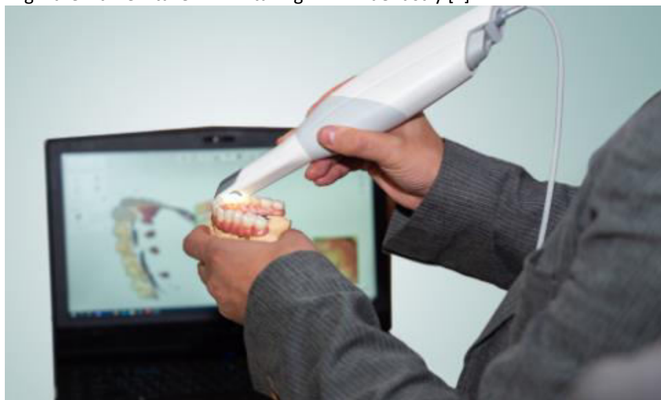
Figure 02: Scanning procedure

impressions and has real-time flexibility. IOS is especially used in designing removable partial dentures, complete dentures, and implant retained prosthetic appliances where the fit and function are excellent. Nonetheless, it is crucial to acknowledge that the considerable expenses and the time spent on adaptation to the IOS application make it an efficient tool in modern dentistry [4].