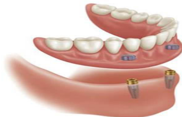
Figure 04 supported view

Intraoral scanning is very efficient in the design of implant protheses as well as the precise capturing of implant location and surrounding tissues. CBI is more desirable in intricate cases as it offers higher levels of accuracy [13].