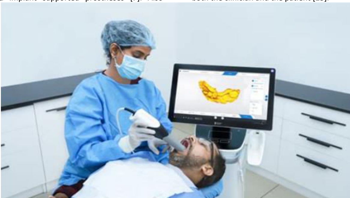
Figure 01:prosthodontic Scan

However, the said development in particular aires a challenges that come with the application of IOS system in removable prosthodontics [14]. First, costs of purchasing and installing of IOS technology and its impact on the new methods of learning by the dental professionals and some technical issues in acquiring the detailed patient's body contours are the main challenges. Also, the review will consider the future clinical trials, which are imperative to define the standard of practice and demonstrate the prospects of IOS regarding the conventional approach [8]. Therefore, this is a narrative review of the transformative effect of intraoral scanning in the construction of removable prostheses that will be useful to the dental practitioners and researchers focusing on digital dentistry tomorrow. The review therefore emphasizes the various possibilities through which IOS could improve or develop the prosthodontic outcomes in favor of both the clinician and the patient [13].