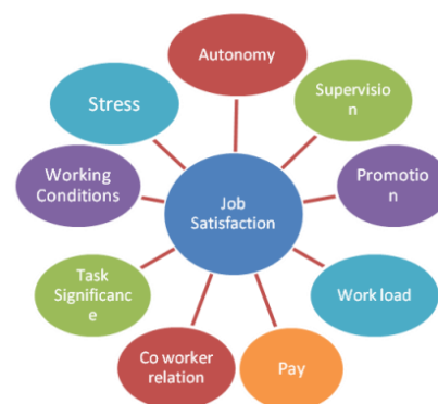
Figure 1- Facets of job satisfaction

Work-life balance refers to striking a proper coordination between the work and personal life of an individual. This is the stage where a person is feeling at ease in managing family and job related obligations. WLB is defined as the power which can be used in terms of productivity and efficiency in different areas of work and life for making good decisions. In the process of balancing multiple criteria, WLB incorporates activities that have the potential to promote employee autonomy and flexibility.