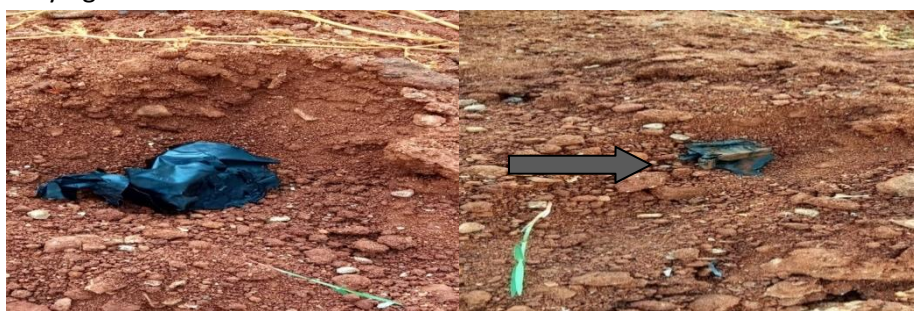
Figure.5. a) Edible pouch placed in soil initially, b) edible pouch after 15 days in soil

The biodegradability of the prepared film was tested by using the soil burial method. The film was analysed for its size (15x4mm), biodegradability efficiency and the presence of microorganisms before and after burying in the soil.