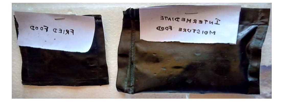
Figure.4. Food products packed in the edible pouch