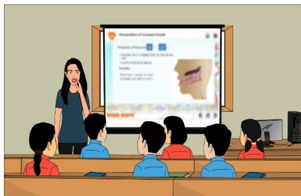
Figure 3. An example of multimedia English teaching

In addition, during the language learning process, the input of visual materials and context will play a key role. Displaying an image activates many areas of the brain, recognizing a familiar image causes the brain to connect various knowledge, concepts, and related things. Images can also be used to explain the meaning of a series