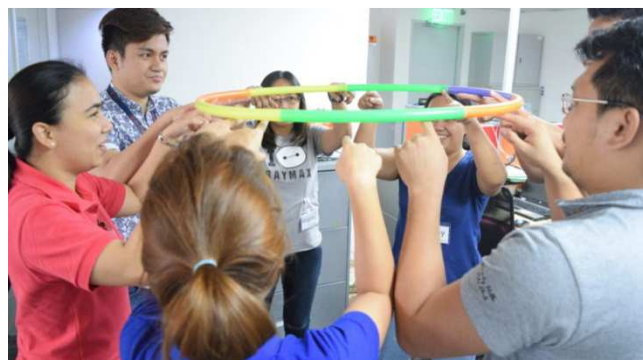
Figure1. Screenshot of an example of the training intervention sessions

Final session: Final evaluation (participants filled the questionnaires at after the intervention and then they were thanked for participating in these classes).