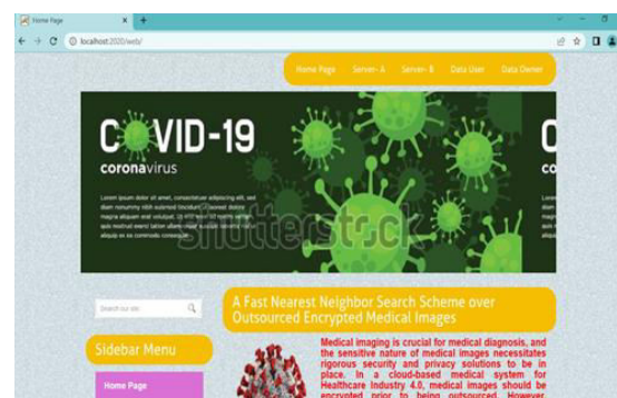
Fig 2: Showing Home page