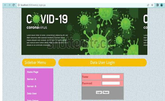
Fig 5: Showing Data User Login page