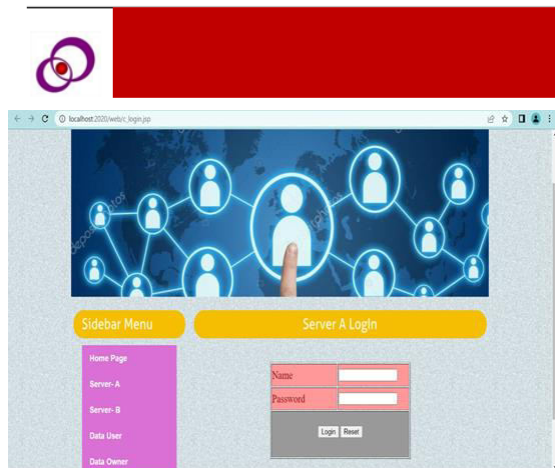
Fig 3: Showing Server A Login page