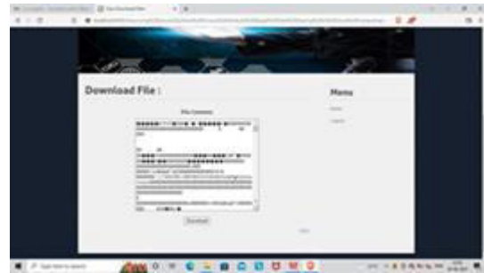
Fig 4.3 Decrypted Data