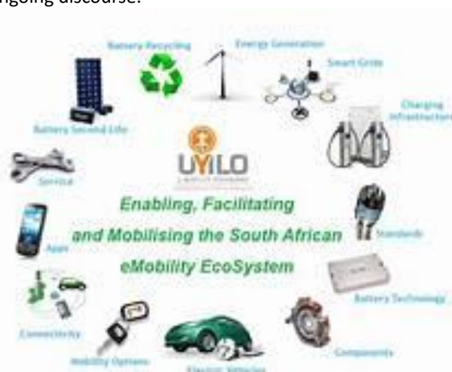
Fig 1. The EV Ecosystem

In this section, we delve into a detailed exploration of the eco-friendly materials that have garnered attention as potential alternatives in the construction of electric vehicle (EV) structures. These materials have the promise of reducing the environmental footprint of EV production while maintaining or enhancing performance. We present an overview of the eco-friendly materials under consideration, their properties, advantages, and challenges, as well as their potential applications in EV structures.