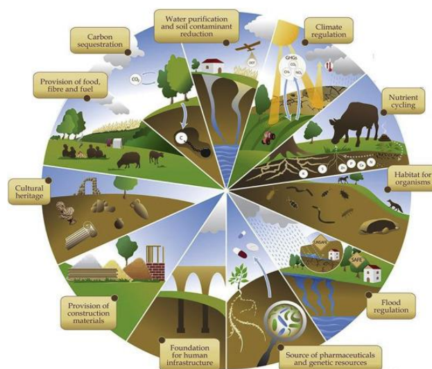
Fig. I. Changing of Physical and chemical properties of the soil

into the soil as dry, occult the deposition and possibly can undermine the physical and chemical properties of the soil. It is to be noted that the change in the chemical and physical properties of soil leads to infertility that may result in a negative impact on the agricultural purpose.