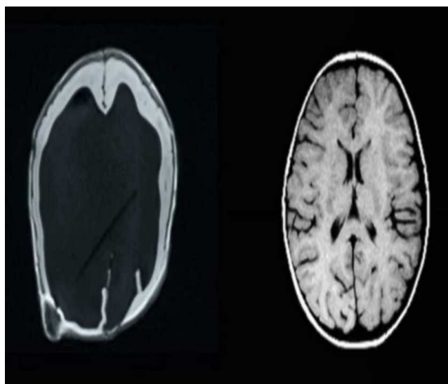
Figure 2. (Top View). MRI scans of Noah's brain at 3 months (left) in comparison to a normal brain of a child at 3 months (right)

As discussed earlier, in neuroscience, the brain cortex is considered as the seat of consciousness. Accordingly, the emergence of free will and readiness potential are known to arise in the cerebral cortex (Panagiotaropoulos et al. , 2012). But in the present case, the cerebral cortex was missing from Noah's brain, as can be seen in Fig 3. However, the brain scans did show the presence of the midbrain and brain stem, but the cortex was completely absent. In the absence of a cerebral cortex, the neuroscientific view of consciousness, free will and choice are highly challenged. Neuroscientists claim that the cerebral cortex in newborns are non-functional, as they possess the embryonic system of 'cerebral cortex,' which is not yet functioning, because it is still immature. Babies are therefore considered 'brainstem beings' (Dubuc, 2009), which may have been the case with Noah. Which means that Noah's brainstem triggered the growth of his brain, which began demonstrating several cognitive functions associated with his upper body, as compared to the severely impaired paralyzed lower body functions (due to the spina bifida). Even in considering the brain stem as the initiator, in this case, the question still remains unanswered as to what is it that triggered the brain stem to make a choice for the brain to re-grow?